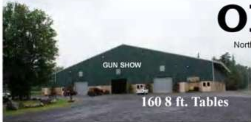
160 8 ft. Tables

NEW, COLLECTOR, ANTIQUE & INVESTMENT FIREARMS, SWORDS AND KNIVES, CIVIL WAR TO WWII MILITARIA, ARTWORK, DECOYS, BOOKS, TRAPS, PISTOLS, GUN PARTS, AMERICANA, OLD/NEW AMMO & HUNTING/SHOOTING ACCESSORIES plus ADIRONDACK LORE, ART, CRAFTS & GUIDES